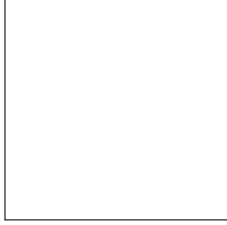
Figure 1: Sample figure caption.

That is because two very distinct explanations can both lead to the same model prediction, especially when dealing with heavily parameterized models: